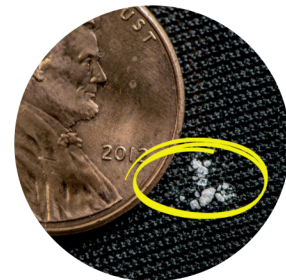
2 mg of fentanyl, a fatal dose for most adults