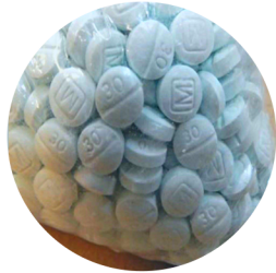
Fentanyl-laced pills seized by the Kansas City Police Department

Local law enforcement are seeing deaths among Northland teens and young adults linked to pills that appear to be prescription pills. Often made to look like real prescription medicine, these illegal pills are laced with the deadly drug fentanyl and it's impossible to tell which ones are counterfeit. Fentanyl is a synthetic opioid that is up to 50 times stronger than heroin and 100 times stronger than morphine. Just traces of the drug fentanyl can be fatal. These pills are being sold on the black market and there is no regulation of any kind.